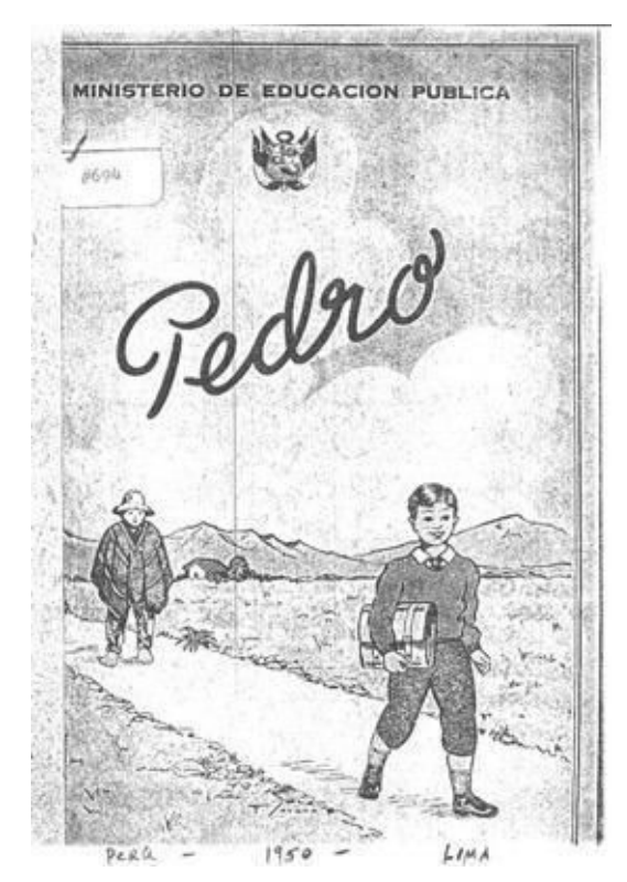
Figure 2: Ministry of Education textbook (1950) 57