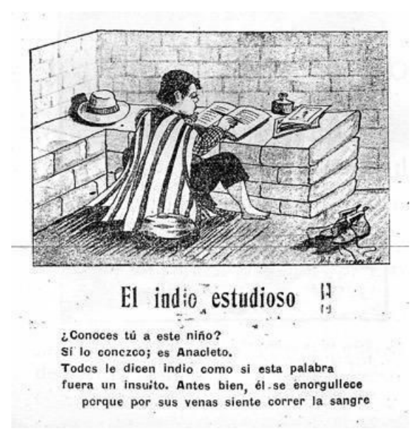
Figure 1: Anacleto: "The studious Indian" 56

Images like the one of Anacleto (Figure 1), recurrent in textbooks from the first half of the twentieth century through the 1980s, illustrate how intellectual elites imagined the educational apparatus could reform Indigenous subjects, both inside and out. In a second example (Figure 2), an aimless, disheveled child wearing Native-looking attire appears in the background, while in the foreground—presumably meant to illustrate the social promise of schooling—the same child appears cleaned up, donning Westernized dress, and perhaps most importantly, carrying books. In all cases, some remnant of Inca greatness remains: for boys, a colorful poncho folded neatly over one shoulder, for example; for girls, long hair neatly arranged into braids (see Figure 3).