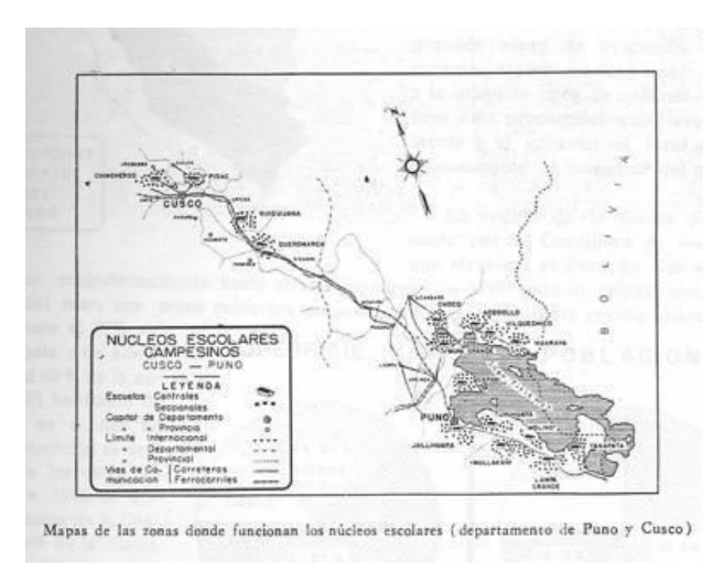
Figure 8: "Maps of the zones where núcleos escolares operate (departamentos of Puno and Cusco)" 72