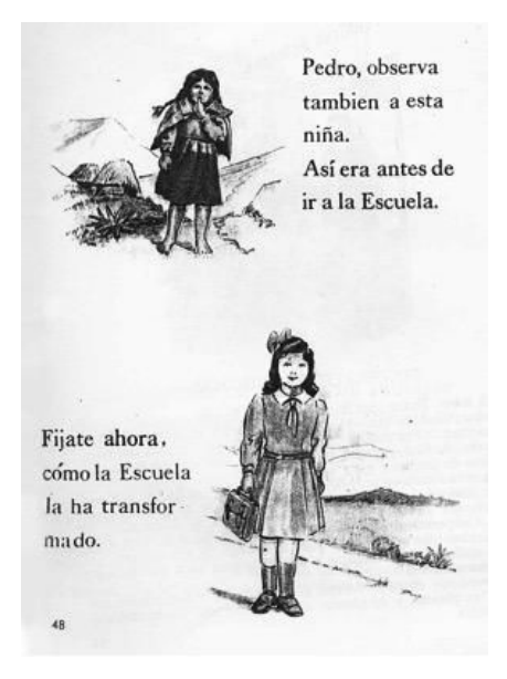
Figure 5: The whitening effects of Indigenous education <sup>61</sup>

just remarkably clean, alas, but also lily white. This racialized permutation is reiterated by textbooks that portray the skin of illiterate children as darker than that of reformed, literate ones.