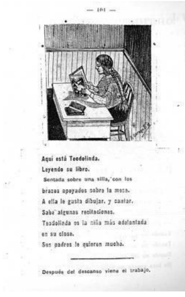
Figure 3: "Literate Indian girl" 58