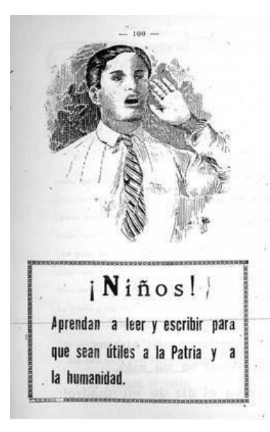
Figure 4: Ministry of Education textbook for "Indigenous education" (1934) 59

In addition to emphasizing superficial physical attributes, educational texts made frequent reference the to indispensability of good hygiene for social transformation and development. Another lesson (a poem) called "La limpieza" thus asks, for example: